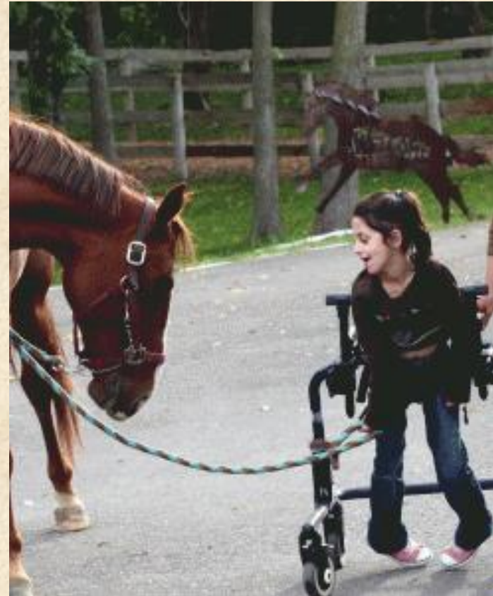
Pearl and Buddy